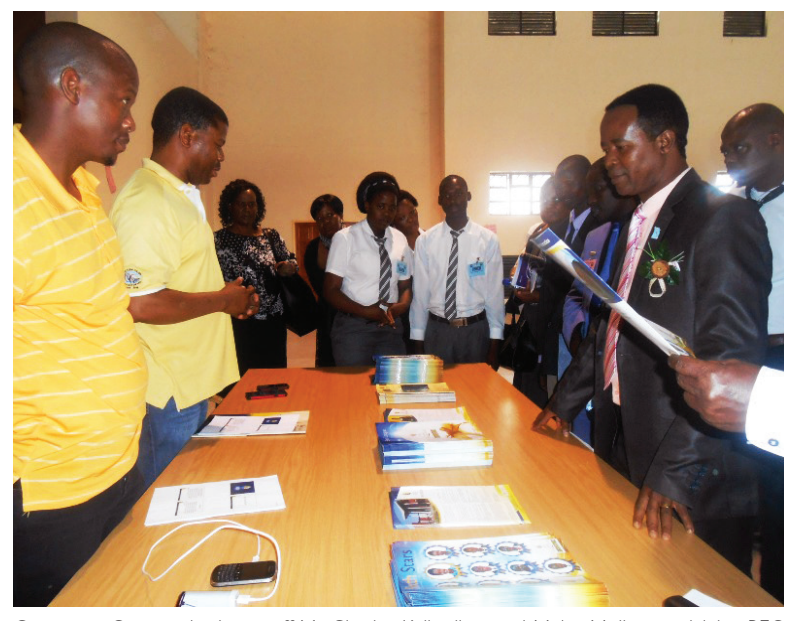
Assistant Minister of Education and Skills Development Hon. Moiseraele Goya.